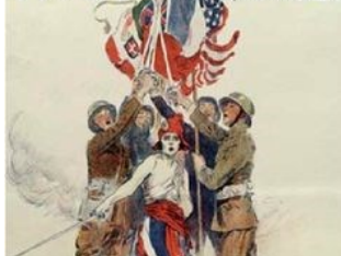
ALL FOR ONE AND ONE FOR ALL! VIVE LA FRANCE!

Neutral Opening: Builds: Army Paris, Fleet Marseilles, (If three) Army or Fleet Brest