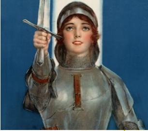
Joan of Arc Saved France